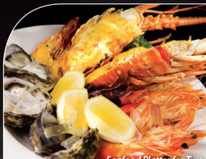
Seafood Platter for Two