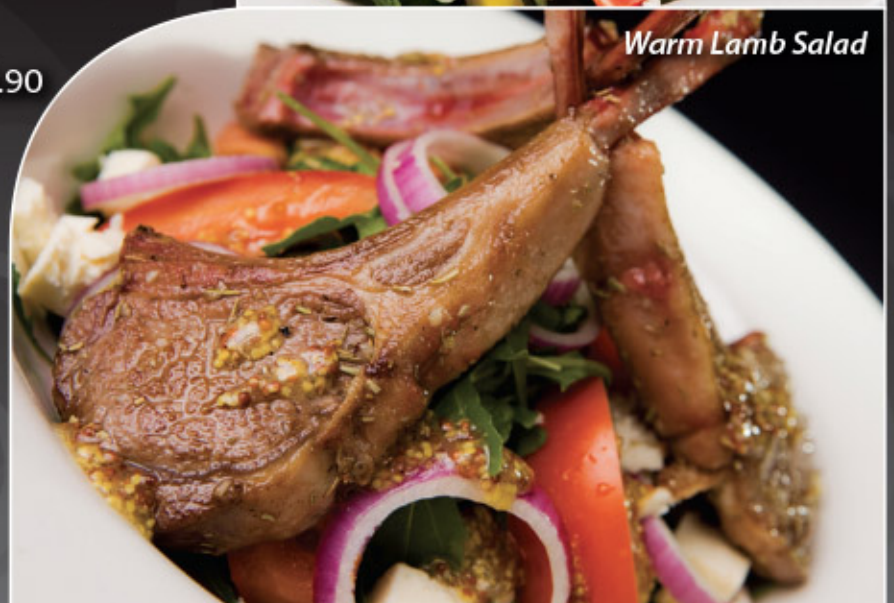
Warm Lamb Salad