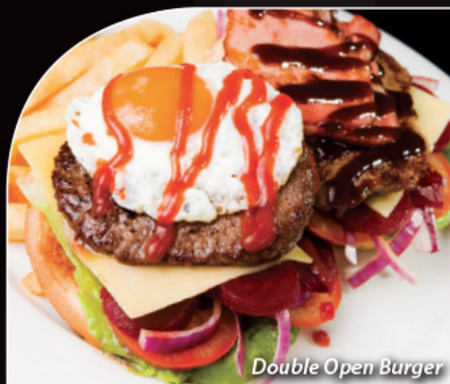
Double Open Burger