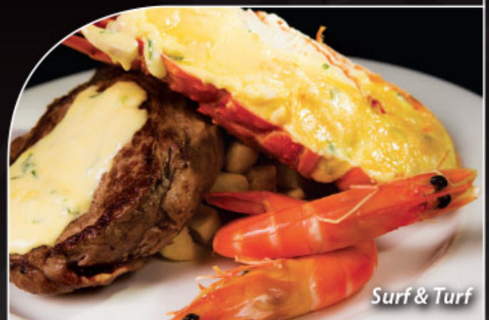
Surf & Turf

Mafiasco Sauce $6.90 Four tiger prawns, roasted capsicum, mushroom & tomato cooked in a chilli & lemon red wine jus